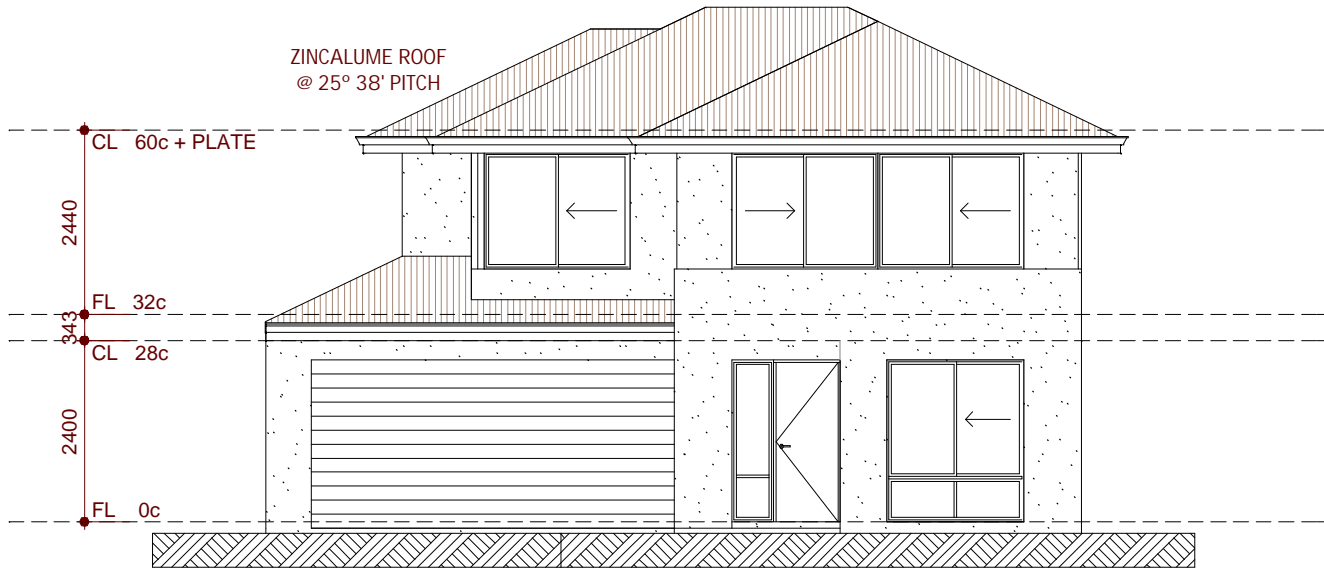
ELEVATION 1 1:100